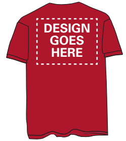
Design on back