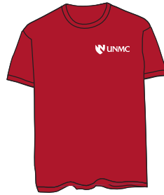
Logo on front